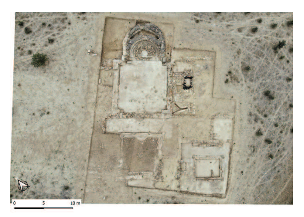
Fig. 2. Aerial view at the end of the 2019 campaign.

was used to create illusory and suggestive scenarios: behind the stiba dium stood a floodgate, allowing for the flow of water to be controlled<sup>1</sup>. The floor in this room was therefore laid using opus signinum instead of the usual mosaics, prevalent throughout the region's villae . The décor, which was destroyed in large part by the collapse of the walls, was partially recovered via excavation: the walls were connected to the floor using marble slabs, and the upper sections of the elevations would have been covered in panels of multi-coloured mosaics depicting aquatic plants. A marble architectural element, which would possibly have been part of a skirting board at the top of the wall, fits in with this design, therefore resulting in a coherent decorative language. The theme of water, or the design of nympheum -type spaces, was common to other villae in this area of Lusitania (Carneiro 2019a, pp. 9-12), where the continuous efforts made to fuse natural landscapes with built environments can be detected (fig. 3).