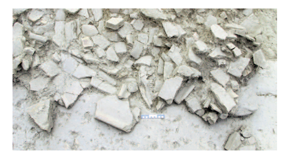
Fig. 5. Jawbone in [UE16], small peristyle.