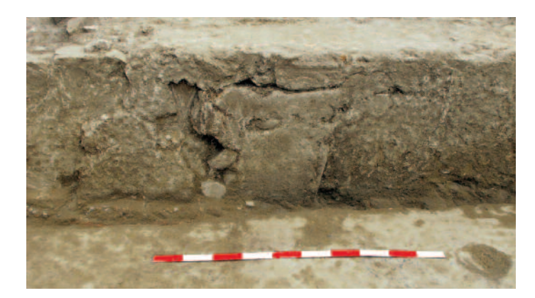
Fig. 4. Northern wall in the stibadi-um room [UE40] with marble slabs removed.

It has not been possible to determine if these actions took place at Horta da Torre: