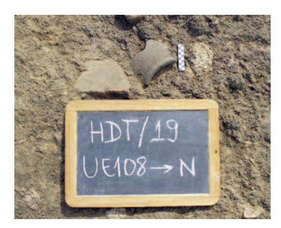
Fig. 7. Example of ceramic found in dumping areas [UE108].

which those who wished to access the stibadium would have had to walk around. Just as the small peristyle, a layer [UE108] filled with sections of bone covered in cuts and teeth marks, including jaws, could be found in the large pericycle, as well as remains of coarsely manufactured containers with visible marks providing evidence that they had been used for culinary purposes (fig. 7). It is therefore possible that this central area of the peristyle — which was part of the throughway to the stibadium room — could have been used as a space for dumping refuse.