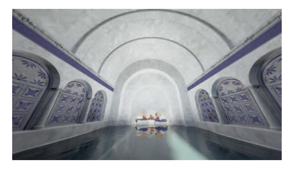
Fig. 3. 3D proposal for the double-apsed stibadium room (André Carneiro, Gonçalo Lopes and Carlos Carpetudo, 2016).

The excavation did not allow for the roofing of this room to be documented, or even whether it had been covered at all. However, the collapse of the walls resulted in a universal layer made up of a chaotic accumulation of stone, mortar and fragments of mosaics from the parietal coverings coating the entire surface of the room. It is this unit, which is extremely thick and robust, that determined the context within which the villa was occupied post-abandonment, as described in the following point.