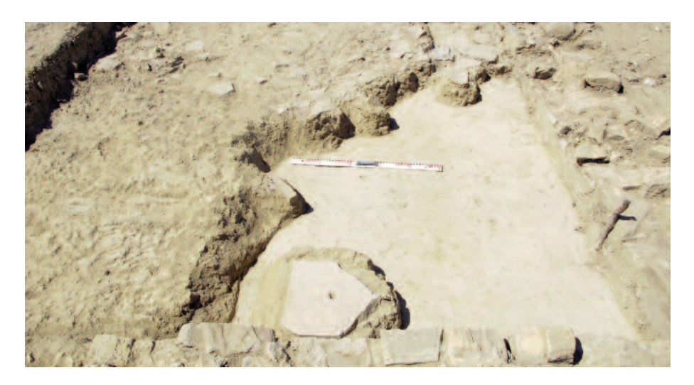
Fig. 6. Marble column basis found in the compartment attached to the small peristyle, found in an inverted position.

which household products were stored, signalling, in addition, the lack of capacity to store any additional materials or contents on a wider scale. It should also be added that in imperial times, the presence of dolia in this context would be anomalous, as the peristyle would have been a private space designed to provide a rest area in the spaces around. Finally, it should be noted that a fragment of granite millstone was found in this layer, which would have been used to make flour, the only evidence of this type found in the villa.