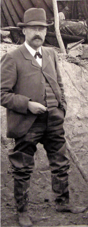
Fig. 1. The archaeologist Gabriel Gustafson was one of the architects behind the Norwegian The Protection and Preservation of Antiquities Act from 1905. Photo, from the excavation of Osberg 1904.

Archaeological excavations are still a public task, performed by the five university museums 1 and the Norwegian Institute for Cultural Heritage Research (NIKU) (responsible for investigations of churches, castles and medieval towns). In addition, three maritime museums perform underwater investigations. The responsibility for the execution of surveys and registrations is divided amongst the nineteen counties and the Sámi Parliament. The Directorate of Cultural Heritage (Riksantikvaren, RA) grants the permission to remove sites and monuments through dispensations from the law, or in opposite cases raise objections. Dispensations are granted on certain conditions, decided on by the Directorate (RA) , for instance demands for excavation to secure valuable scientific data.