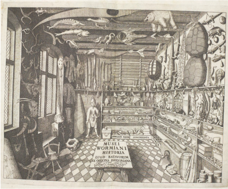
Fig. 2. Ole Worm's cabinet of curiosities became the first public collection of artefacts purchased in 1654 by the King of Denmark and Norway. The frontispiece of "Musei Wormiani Historia", 1655.

Snorri Sturluson's Chronicle of the Kings of Norway was published as Norske kongers Chronica (1633). These translations provided scholars a new non-biblical frame of reference for archaeological monuments. Large burial mounds and medieval churches were associated with the kings in the sagas and political history.