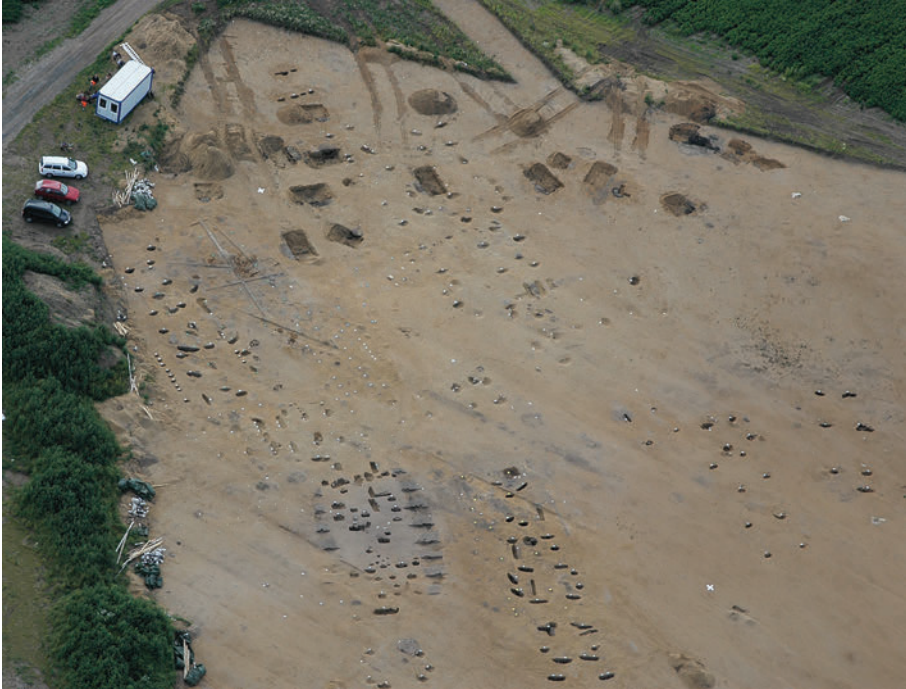
Fig. 3. Since the introduction of top soil stripping in Norway in the 1990 th , there have been found c. 450 prehistoric houses (per 2010) only in the administrative region of Museum of Cultural History, South Eastern Norway. Here the site Western Ringdal, E18 project, Vestfold, showing a farmstead with 21 houses abandoned around AD 600.